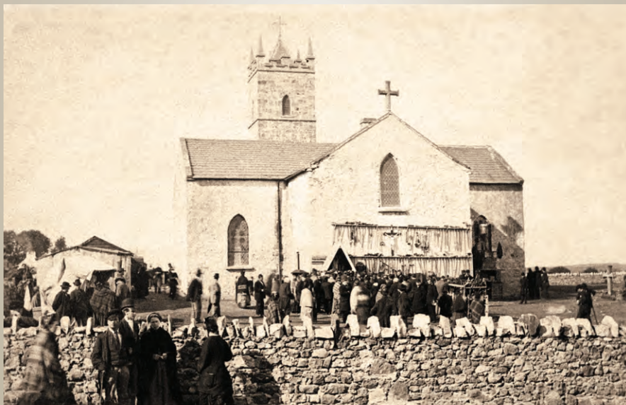
Image: Apparition Gable, Knock c.1880.

Whether you are coming to Knock as a seasoned pilgrim or a stranger to this place, you will find a unique and prayerful place with a completely unique and fascinating history.